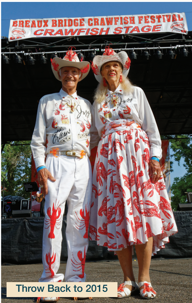
Throw Back to 2015