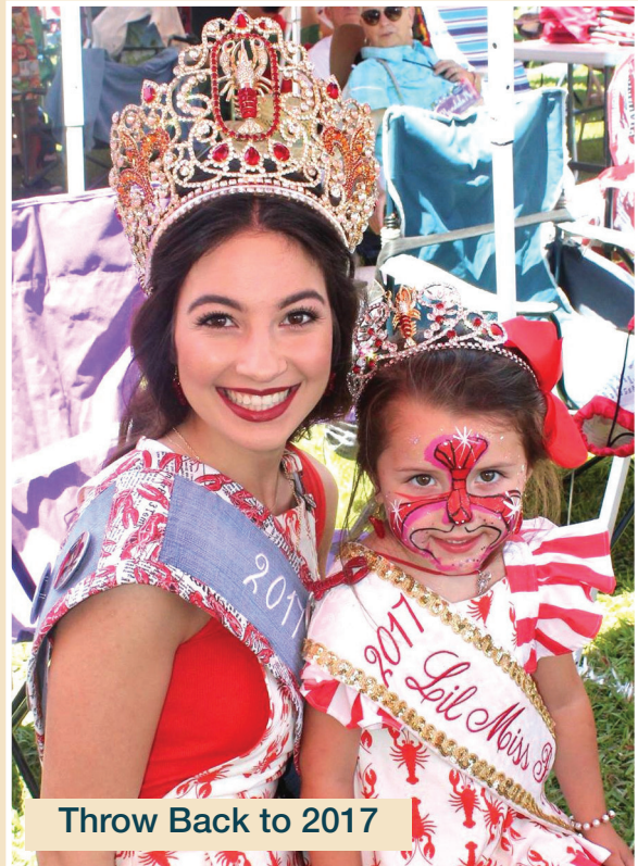
Throw Back to 2017