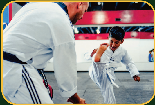
MARTIAL ARTS TRAINING