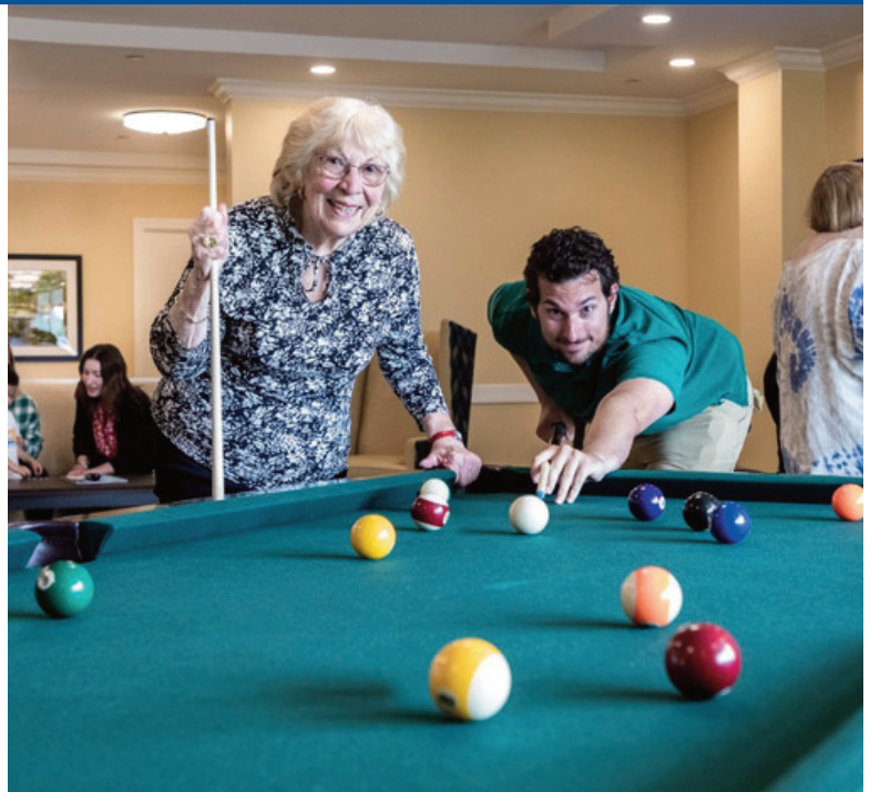
Cue the fun at our billiards table.

Tour the Villas and be Entered into our Monthly Gift Card Giveaway