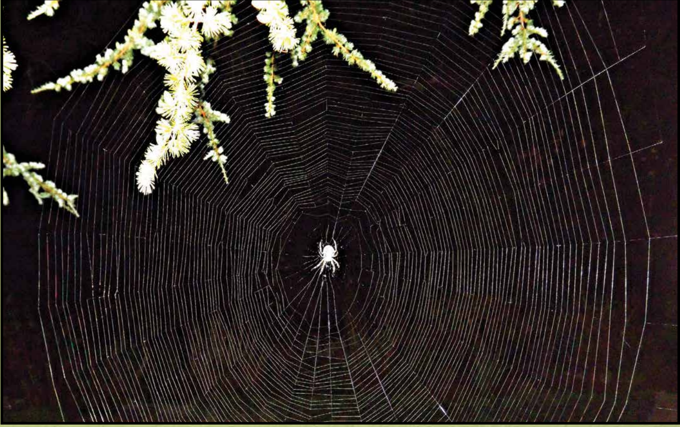
"Getting the Home Ready for the Holiday"