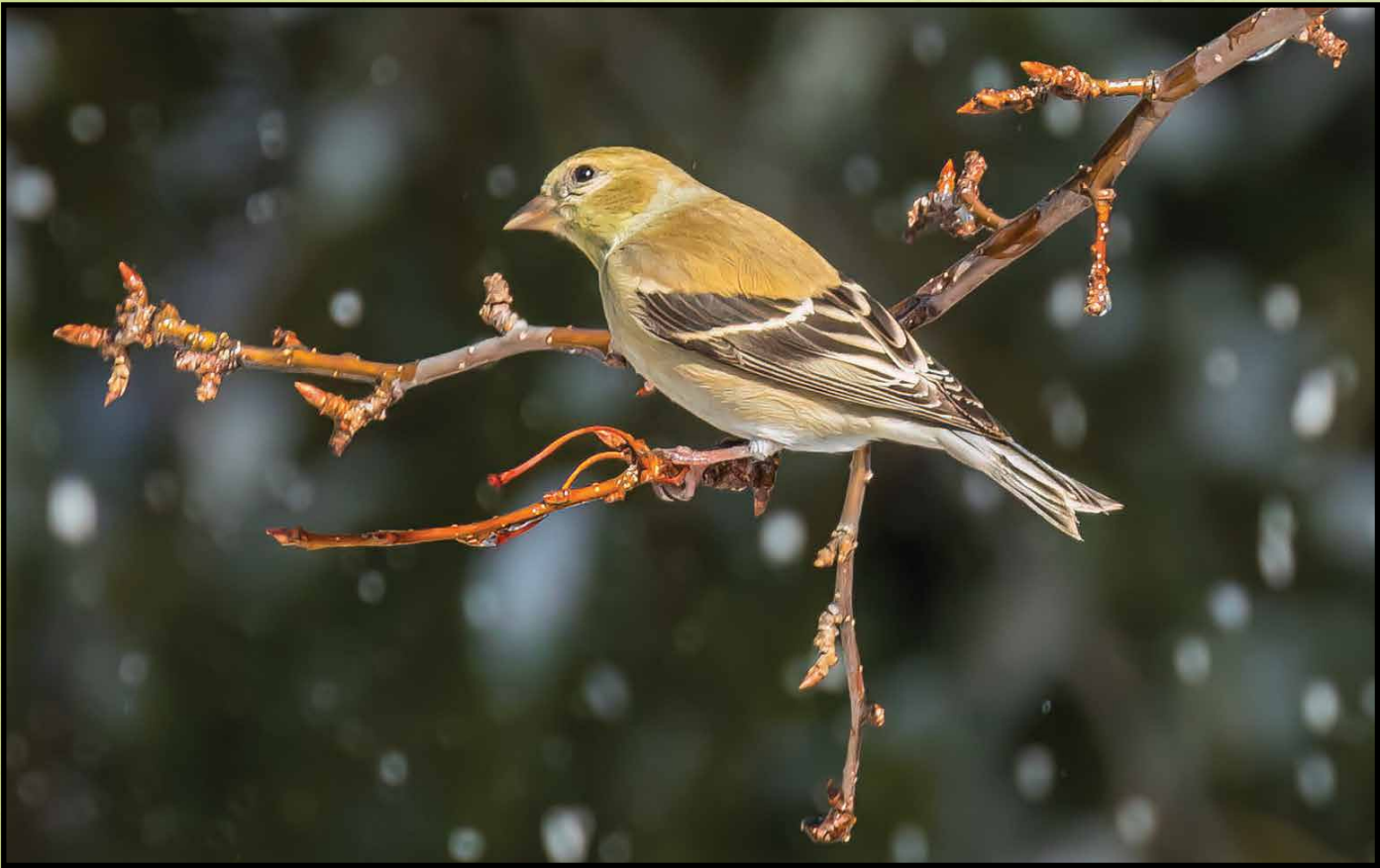
“Finding Gold in Winter”