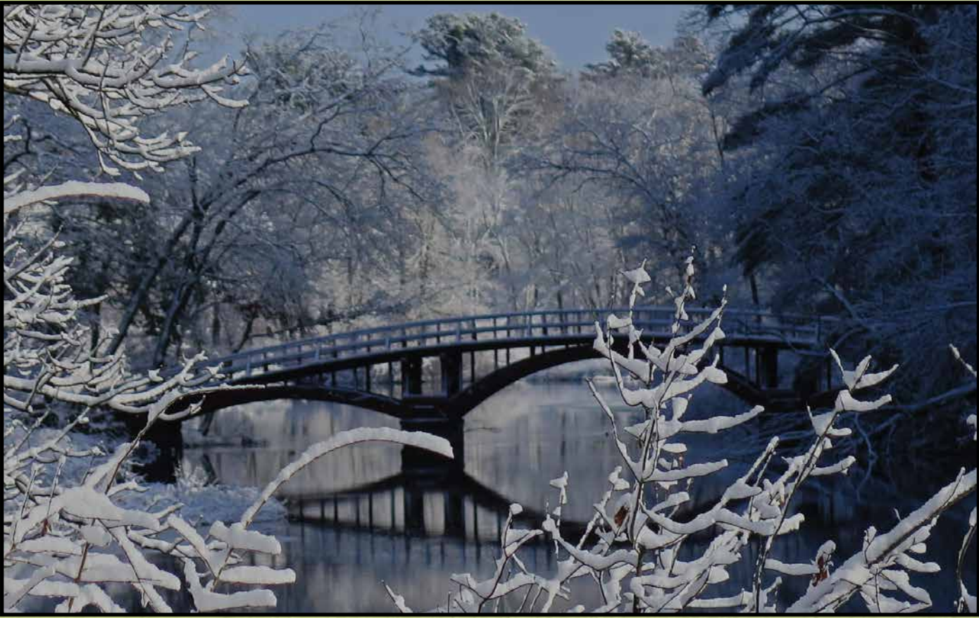
“Charles River Bridge in S. Natick”