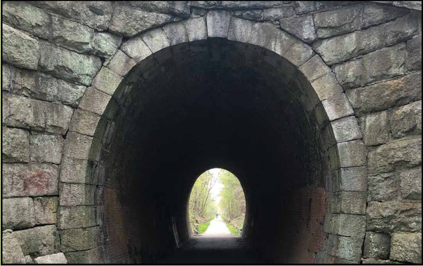
“Phipps Tunnel, Holliston”