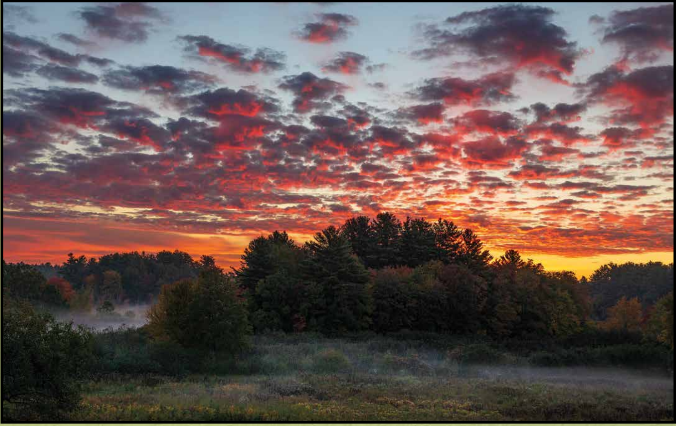
“Dawn in North Sudbury”