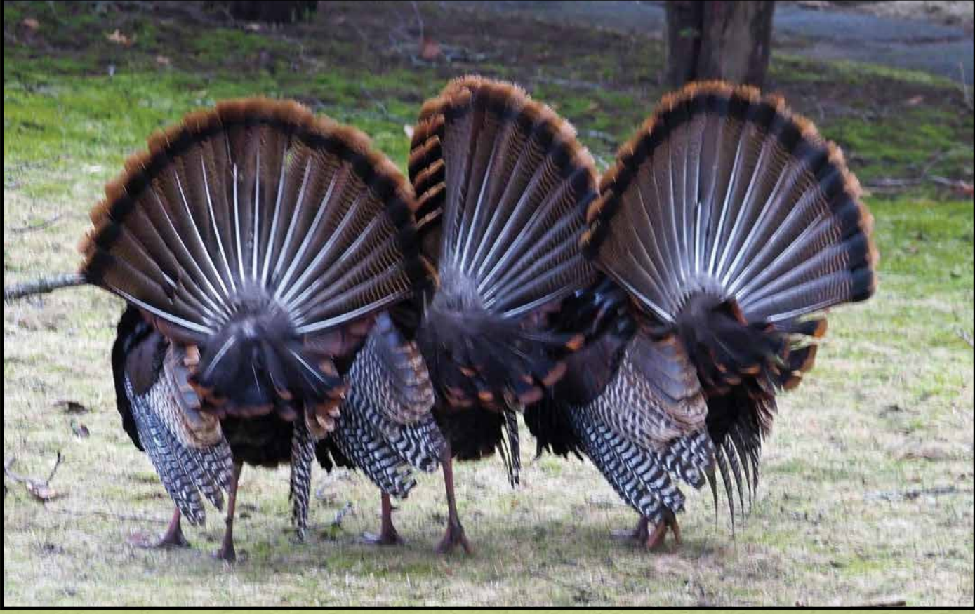
"Turkeys Visit Our Neighborhood and Show Their Feathers"