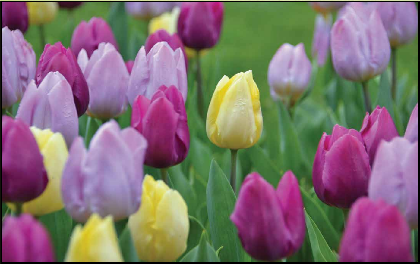
“Hiding in Plain Sight”