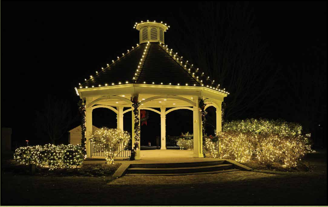
“Holiday Lights Hopkinton Common”