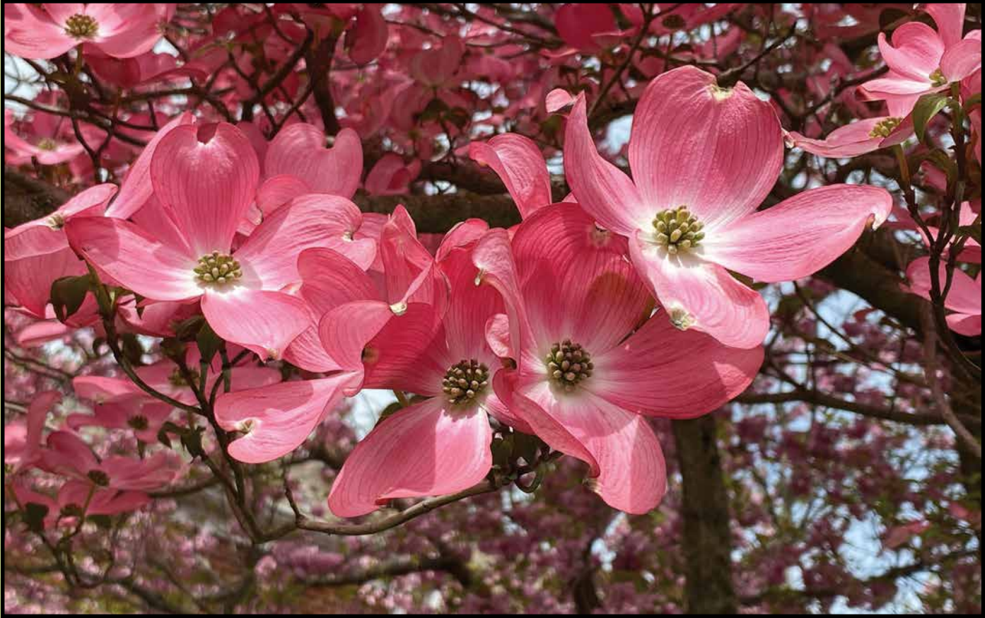
“Beautiful Blooms at the Holliston Post Office”