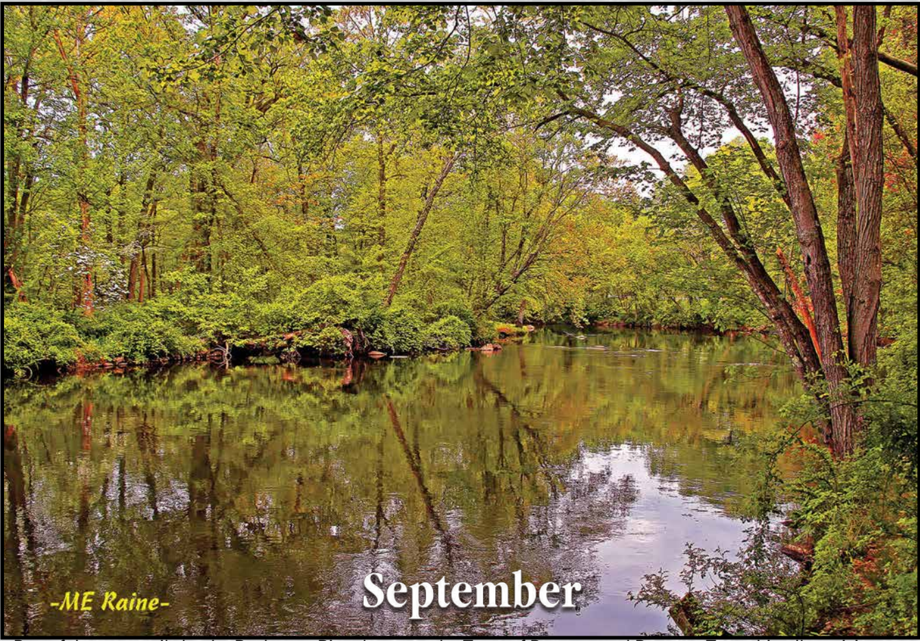
Peaceful nature trails by the Rockaway River between the Town of Boonton and Boonton Township allow visitors to take in many attractive scenes