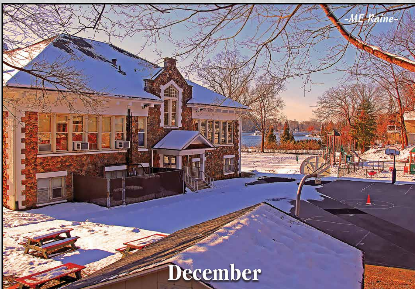
Lake Drive School – For the Deaf and Hard of Hearing – is among the very best in the state, and sits along the northern end of Mountain Lake, a truly picturesque setting . . .