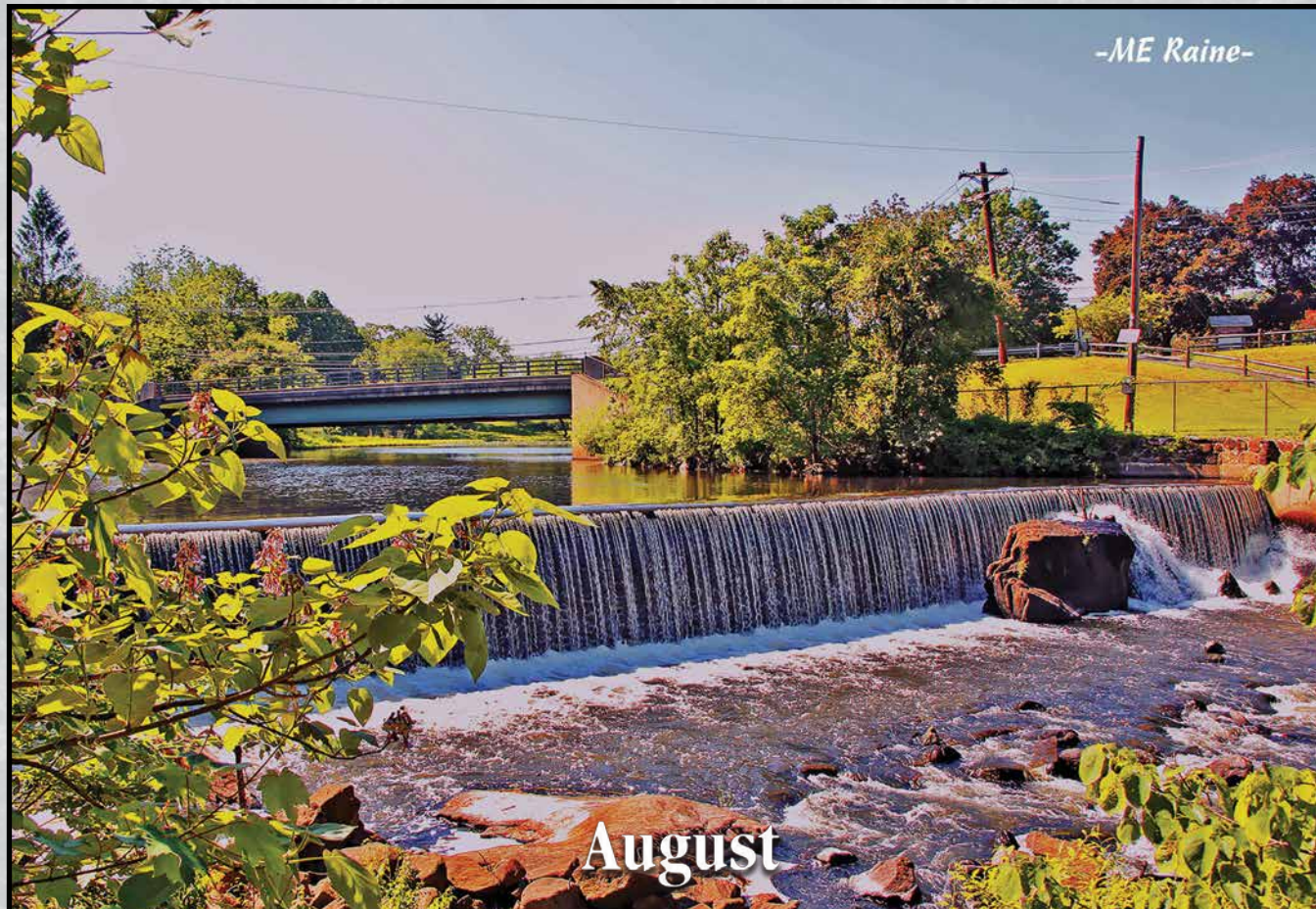
August The very popular Grace Lord Park offers a variety of fun activities, but amazing views of the Rockaway River with the dam and falls can be enjoyed from along the path