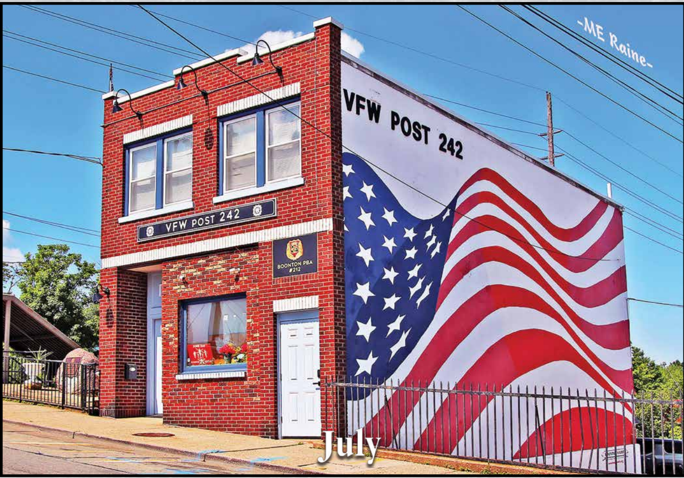
Celebrating Independence Day and our 250th Anniversary – one cannot miss seeing this "Old Glory" (VFW Post 242) by the bridge to the historic downtown of Boonton