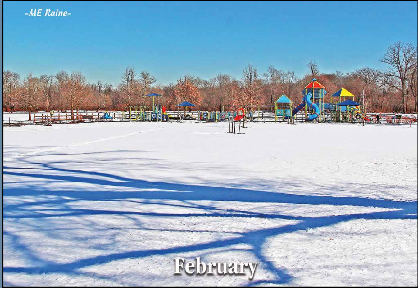
Fun winter activities abound for all ages at Duke Island Park