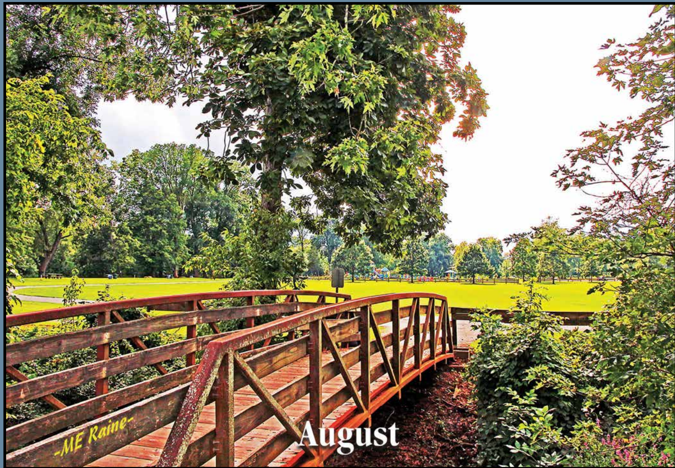
A truly wonderful place for outdoor activities through all the seasons at Duke Island Park