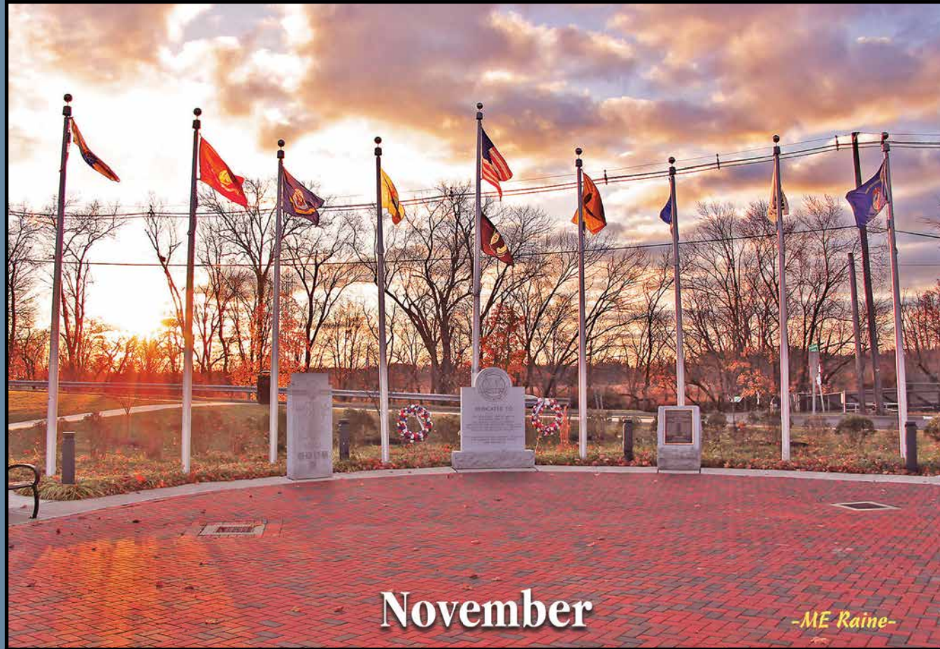
Honoring the special heroes, our Veterans -- first sunrise at the War and Veterans Memorial by the Raritan River Greenway