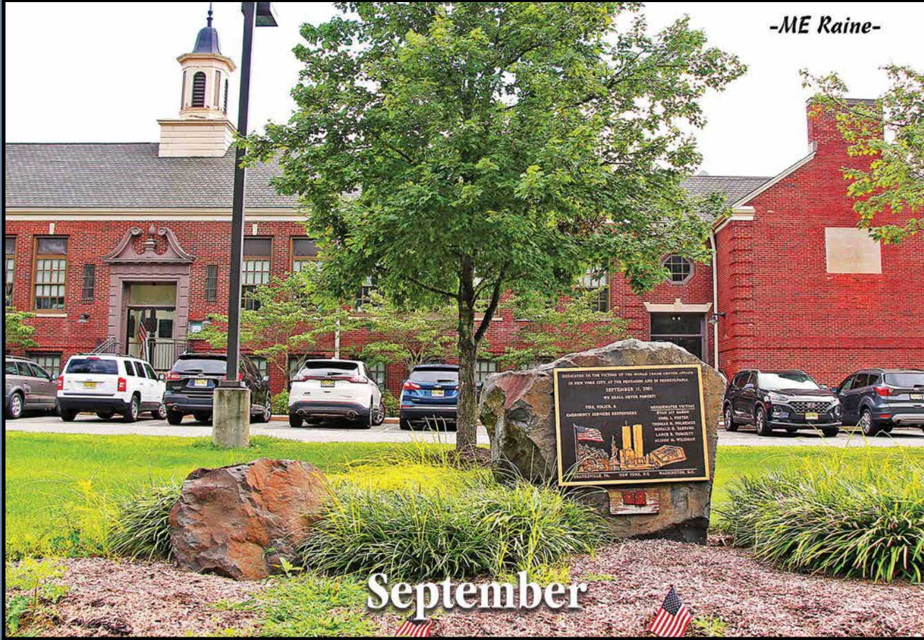
The touching 9-11 Memorial by the Bridgewater Twp. Municipal Complex . . .