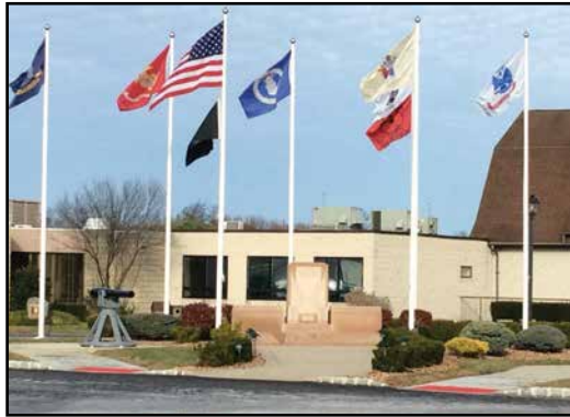
Marlboro Township Municipal Complex Veterans Memorial