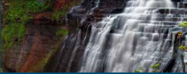
Brandywine Falls