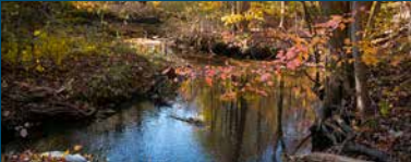
Aurora