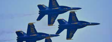
Blue Angels, Cleveland Air Show - Jim Bellantis - JBellantisImages.com