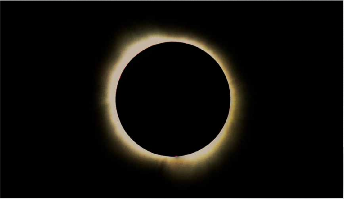
April 8th Eclipse, totality