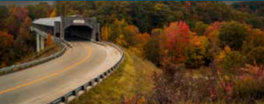
Ashtabula County Covered Bridge