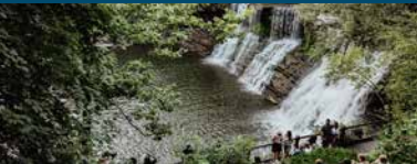
Chagrin Falls