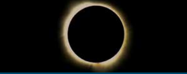
April 8th Eclipse, totality