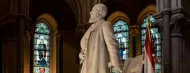
Garfield Memorial Lakeview Cemetery