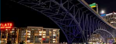
Cleveland - Grace Eapen