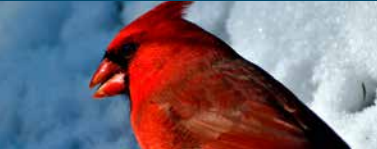
Cardinal - Jim Bellantis - J BellantisImages.com