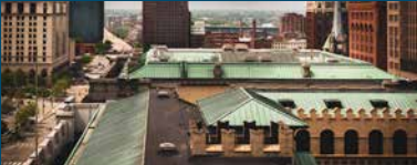
Cleveland Downtown Rooftops