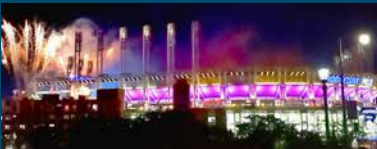
Fireworks at Progressive Field