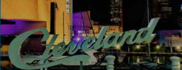
Rock Hall of Fame-North Coast Harbor - Jim Bellantis - JBellantisImages.com

Front Cover: Ruby-throated Hummingbird - Jim Bellantis - JBellantisImages.com